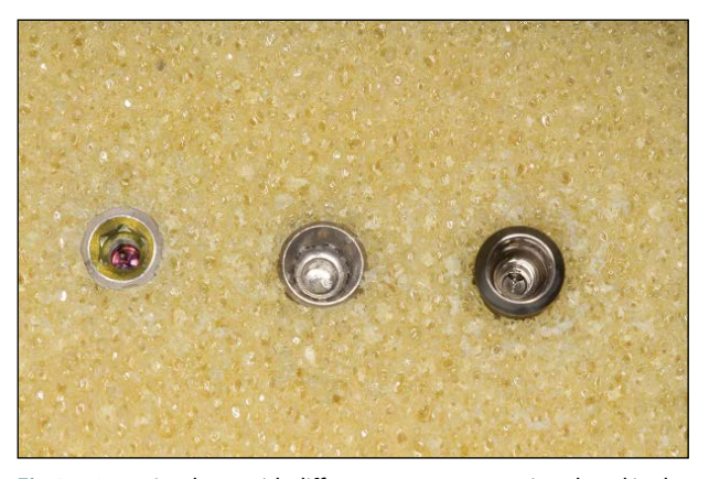
Fig 2 6-mm implants with different macrogeometries placed in the artificial bone block with type IV bone quality.

Solid resin (rigid polyurethane foam) was used as an alternative test medium for human cancellous bone. It does not replicate the structure of human bone; however, it provides consistent properties between human cancellous bone. This closed-cell resin block is most